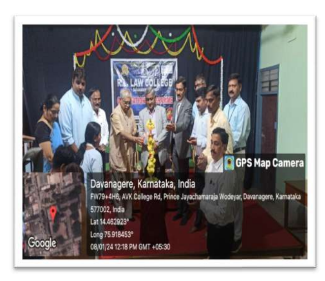
Inauguration by the Dignitaries