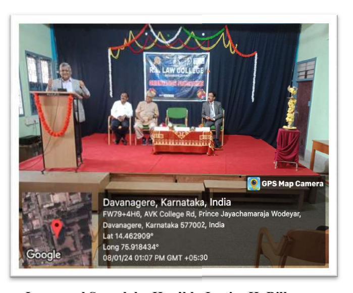
Inaugural Speech by Hon'ble Justice H. Billappa