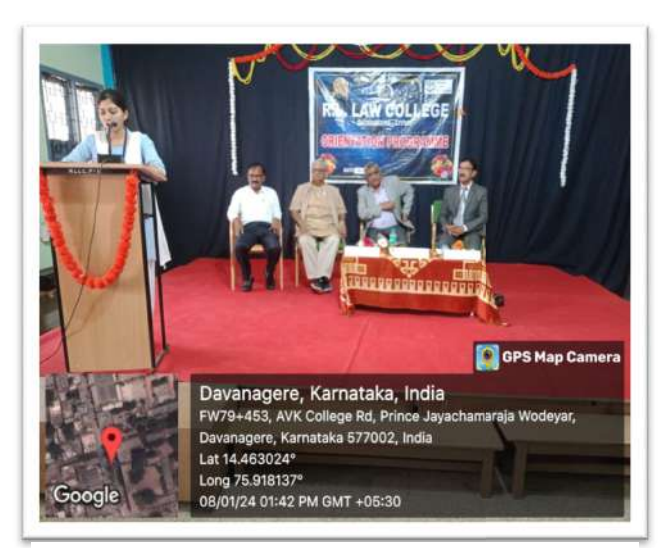
Student Started the Programme