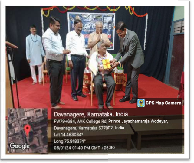
Honourning to Hon'ble Justice H. Billappa